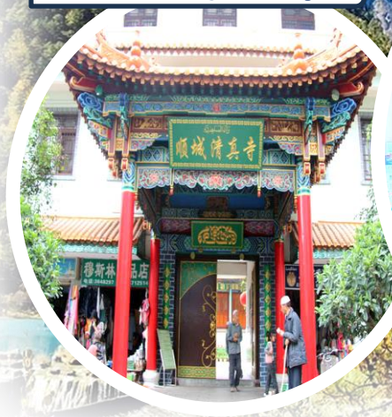
Nanqiang Night Market